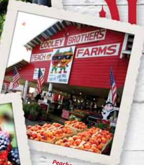
Peaches at The Shed